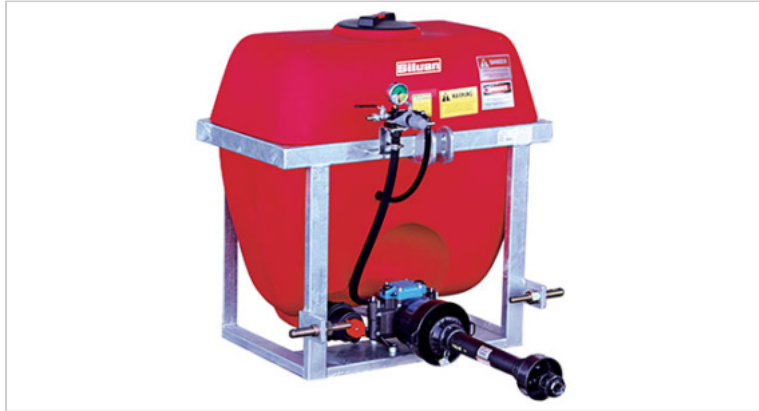
Linkage 300 litre Slimline sprayer with 20L/min pump, no boom