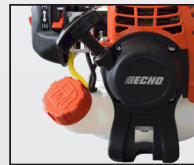
■ Effortless starting system