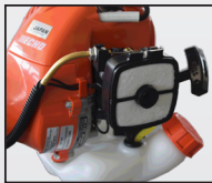
■ Commercial-grade felt air filtration