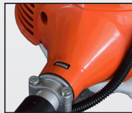
■ Anti vibration system