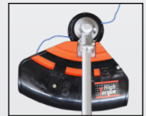
■ Tap & Go nylon line cutting head (F4)