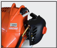
■ Tool-less air filter cover